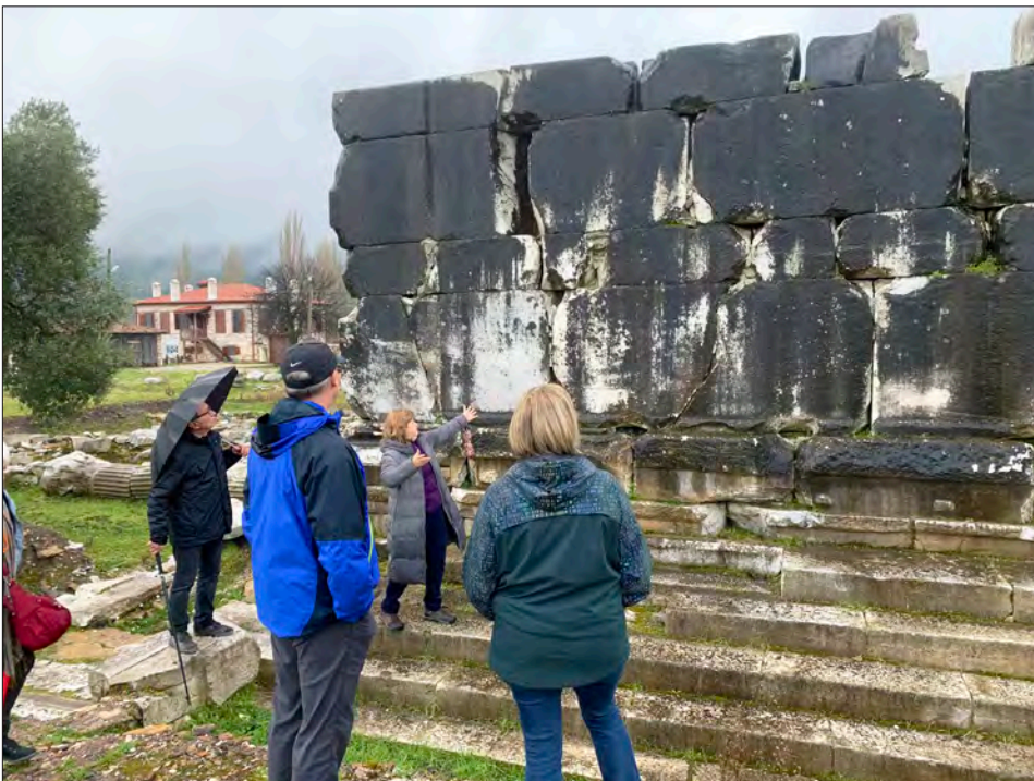
Figure 10: Looking at the Latin inscription (301 A.D.) inscribed on the older Bouleuterion (1st century B.C.) that regulated prices on goods sold in the city, visited by the Friends of ARIT-Ankara during the Trip to Kaunos (Dalyan).