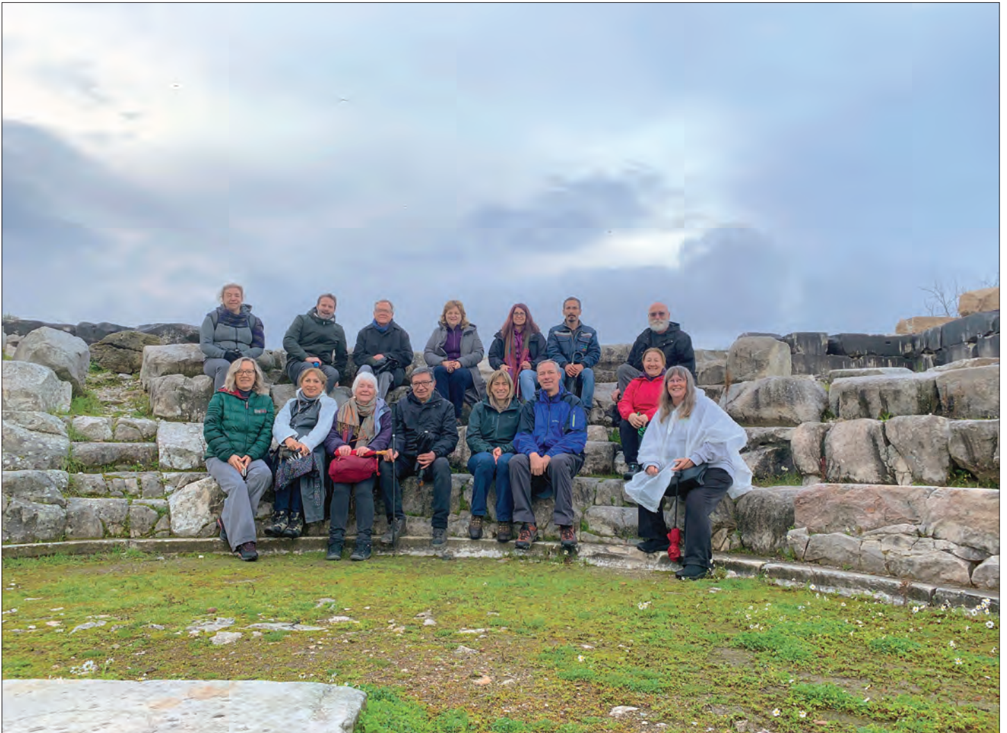
Figure 11: Group photo at the Bouleuterion of Stratonikeia, visited by the Friends of ARIT-Ankara during the Trip to Kaunos (Dalyan).