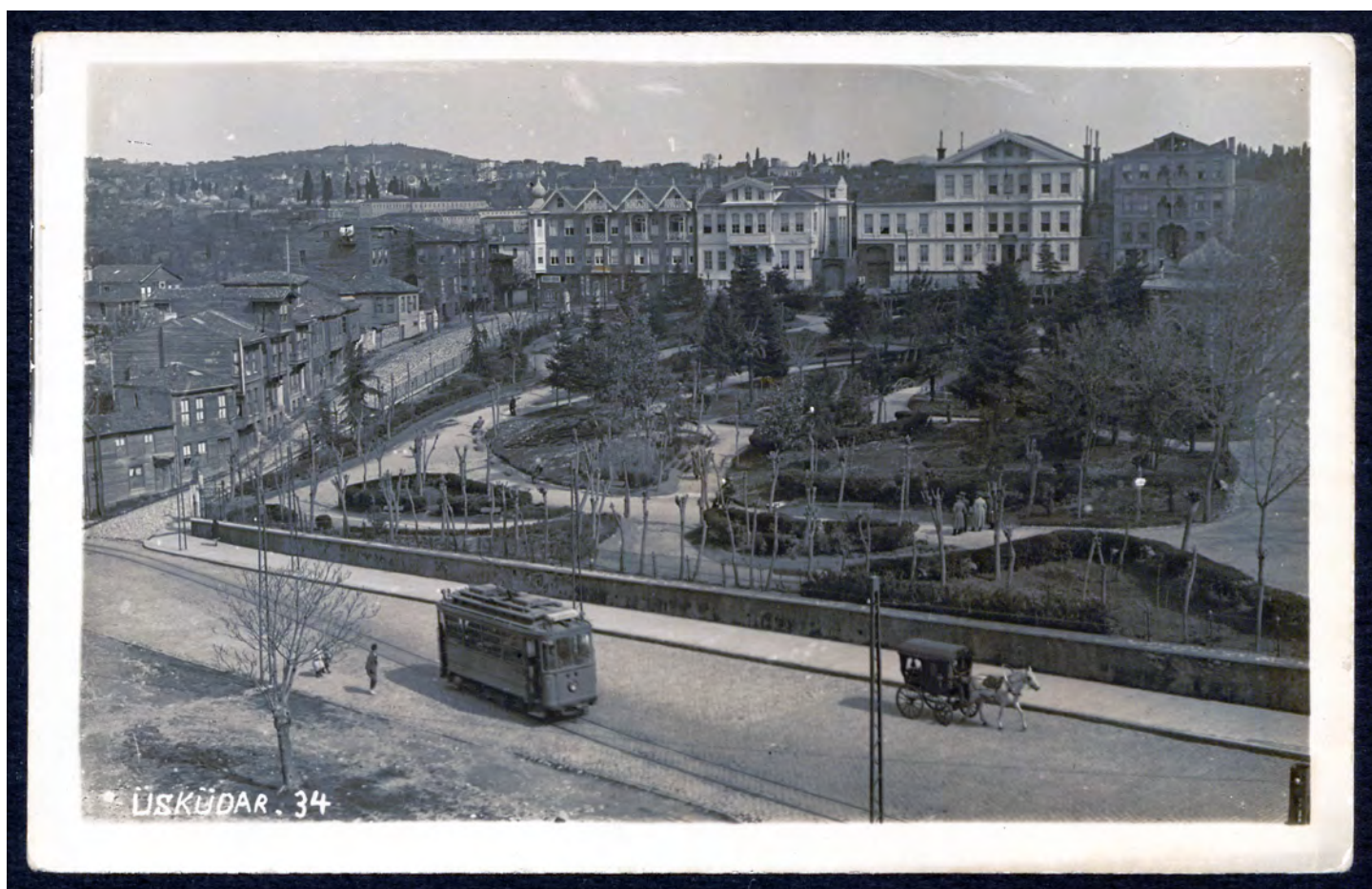
Figure 12: Doğançılar Parkı, Üsküdar, Istanbul, 1934.

Realizing that they could profit from these sites by gating and landscaping them as formalized municipal parks, city leaders leased the parks to property managers to run as businesses. Abiding by a changing set of park rules and regulations and self-monitoring their behavior, a range of Ottoman citizens learned new social