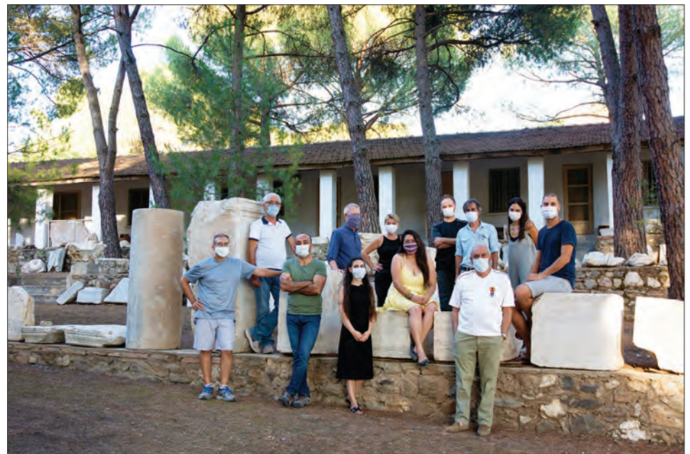
Figure 1: The Sardis excavation team in August 2020.

Against all expectations, American field projects have continued with in-person work at Turkish archaeological sites (figs. 1, 2). For several months, between March and May of 2020, we