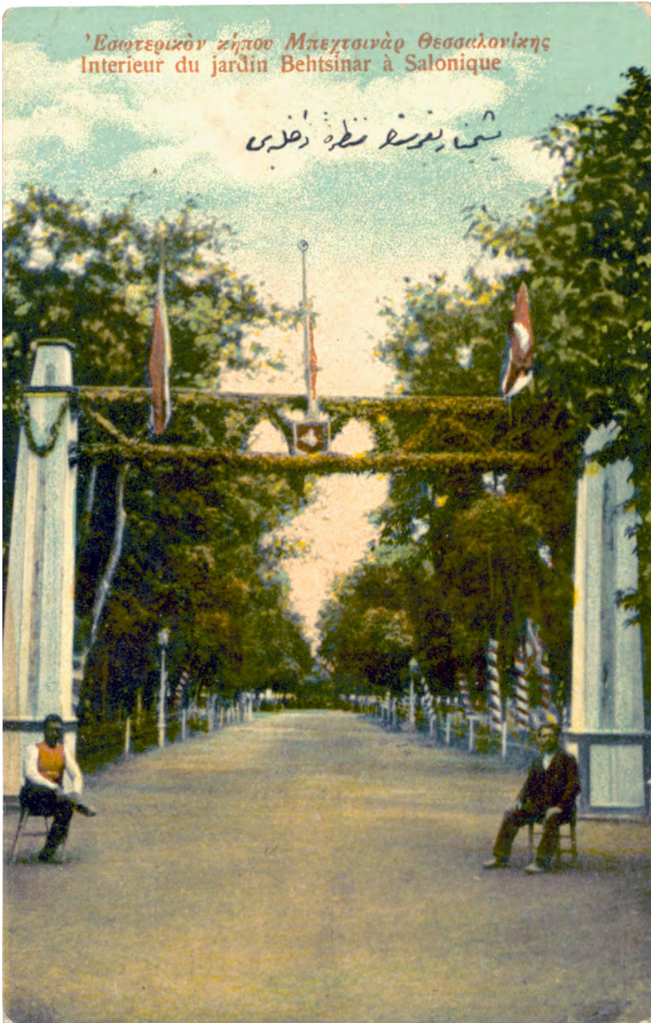
Figure 13: Entrance gate of the Beşçınar People's Garden in Thessaloniki, 1911. Hellenic Literary and Historical Archive (ELIA), part of the National Bank of Greece Cultural Foundation (MIET).

As far as immediate next steps, Duke University's libraries have just acquired three collections of late Ottoman and early Republican postcards of Izmir, Thessaloniki, and Üsküdar. The Thessaloniki and Üsküdar collections have been digitized. To celebrate these acquisitions, they have invited me to give a lecture on some of these images in fall 2020. My lecture will bring together images of the recreation sites documented within these postcards, with a discussion of some of the other images I discovered during my ARIT/NEH fellowship.