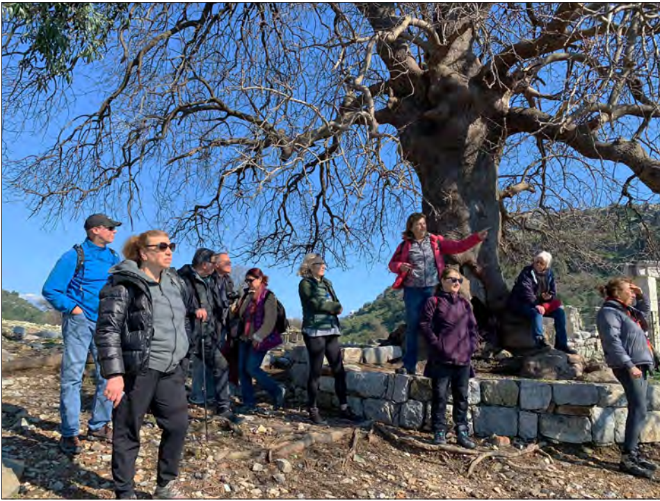
Figure 9: Looking at the sea-port city of Kaunos (Dalyan) from the north, where the modern entrance to the archaeological site is located. Visited by the Friends of ARIT-Ankara during the Trip to Kaunos (Dalyan).